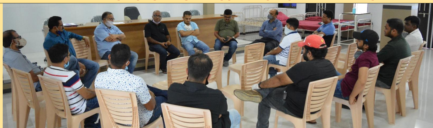
ROTARY CLUB OF CHIKHLI RIVER FRONT TEAM

DETERMINATION IS NOTHING WITHOUT DEDICATION AND HARD-WORK